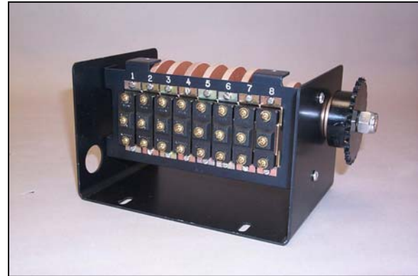
Limit Switch with and without cover